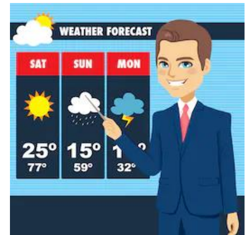
The Weather Reporter