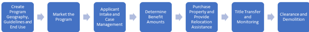
Figure 2: GLO Buyout and Acquisition Process